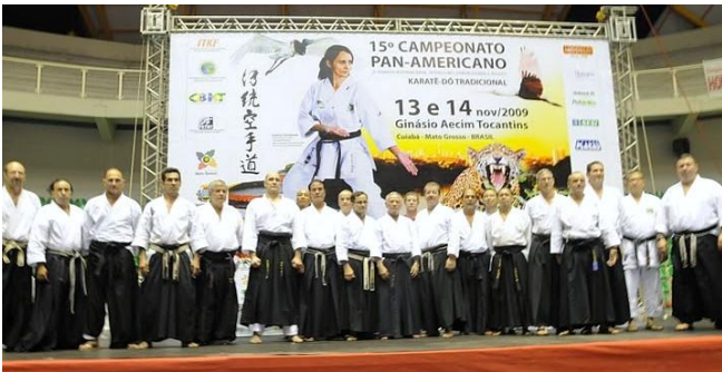
Judges at Pan American Championships