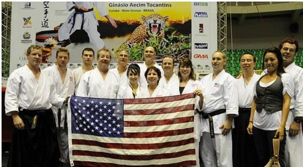
U.S. Team at Pan American Championships at Curaiba, Brazil, November 13 & 14, 2009